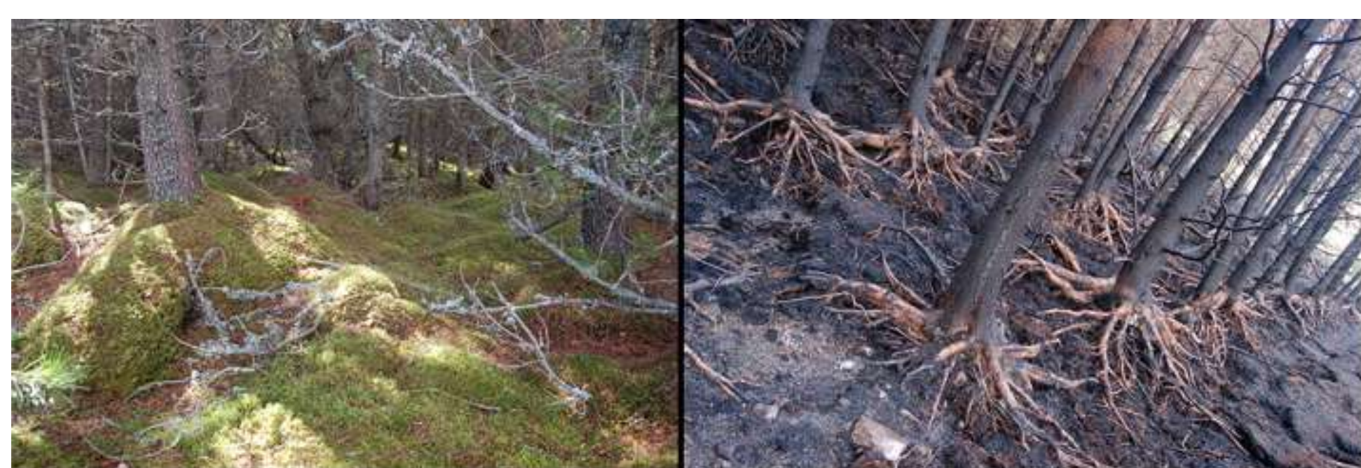
Figure 2: Example of a peat smouldering consequences in Scotland, summer 2006. Left unburned forest, right ground forest after the fire with a severe consequences: the organic soil layers were removed and the the root system was effected.

Smouldering combustion is different from the flaming because the oxidation reaction and the heat release occur on the surface of the solid, burning slowly and without a flame. Smouldering can take place in the organic material stored in shallow forest layers, like duff, humus or peat.